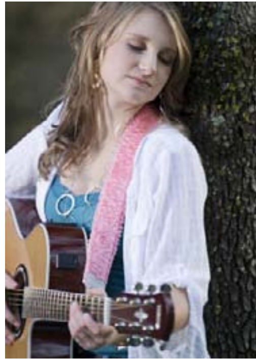
Red Bluff Daily News 02/23/2010 www.redbluff-dailynews.com