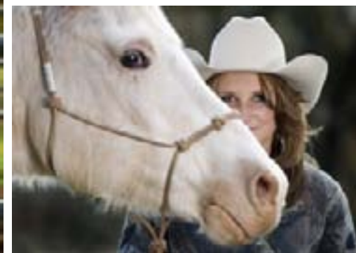
Red Bluff Daily News 02/15/2010 www.redbluff-dailynews.com