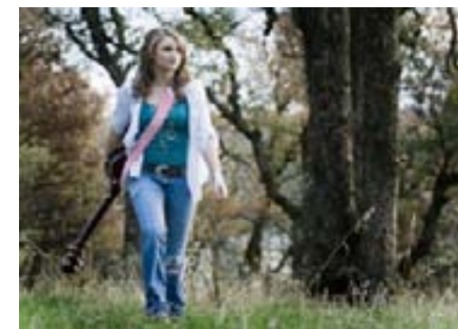
Red Bluff Daily News 10/30/2008 www.redbluff-dailynews.com

Paradise Idols have Red Bluff connection